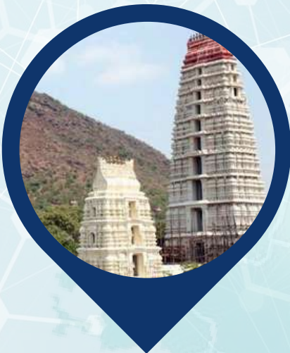
Lakshmi Narasimha Swamy Temple