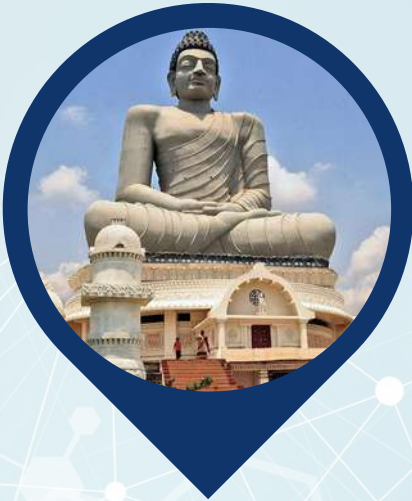
Amaravati Buddha Statue