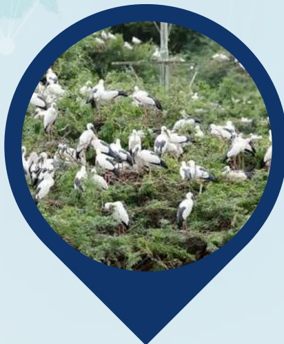
Uppalapadu Bird Sanctuary